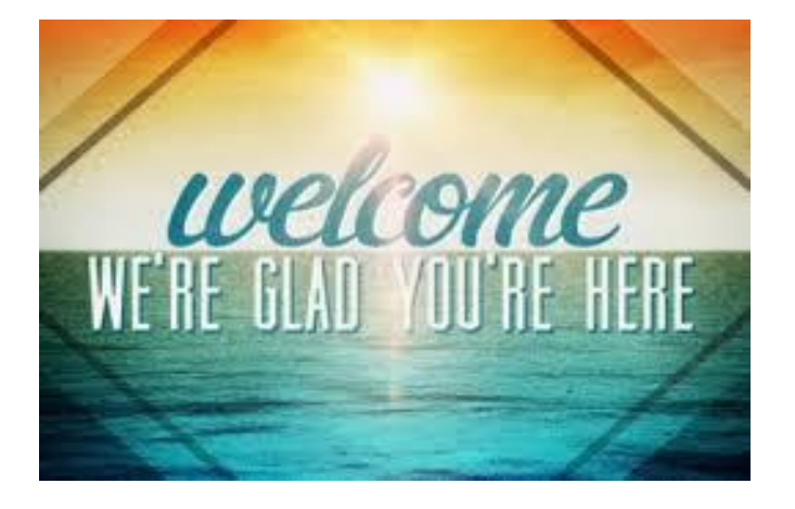
Your fellowship today is important to us. Please fill out the attendance pads at the end of each pew.